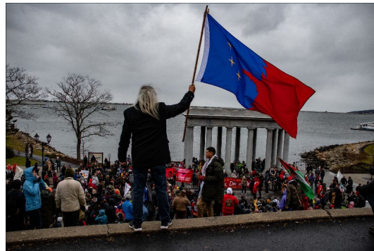
Photos from the 2019 National Day of Mourning in Plymouth, MA.